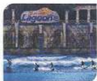
SUNWAY LAGOON Our multi-park destination is home to endless excitement and fun featuring 5 different parks.