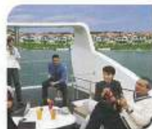
SUNWAY SOUTH QUAY Experience resort style living with lush greenery amidst pure tranquility.