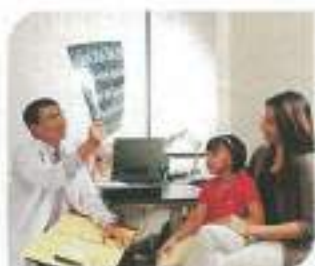
SUNWAY MEDICAL CENTRE We provide top quality healthcare with 17 Centres of Excellence.