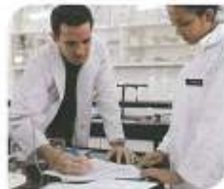
JEFFREY CHEAH SCHOOL OF MEDICINE AND HEALTH SCIENCES We provide state-of-the-art educational technologies to enhance the teaching-learning process.

The Green Building Index Award is an industry-recognised environmental rating system evaluating the environmental design of buildings based on 6 main criteria encompassing Climate, Energy & Water, Environmental & Ecology, Community Planning & Design, Transportation & Connectivity, Building & Resources, as well as Business & Innovation.