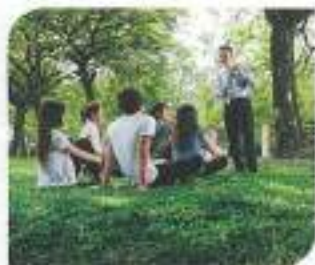
SUNWAY UNIVERSITY We shape the leaders of tomorrow and inspire them to change our world for the better.