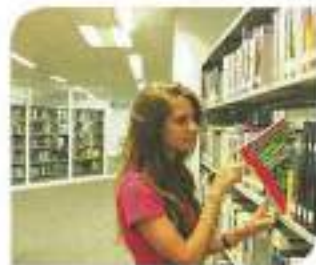
MONASH UNIVERSITY SUNWAY CAMPUS We present students with opportunities that guarantee bright futures ahead.