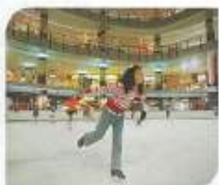
SUNWAY PYRAMID Shop, dine and unwind with family and friends at Malaysia's favourite mall.