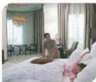
SUNWAY RESORT HOTEL & SPA Experience 5-star service with world class facilities and create sweet memories with loved ones.