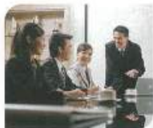
MENARA SUNWAY We provide an ideal working environment close to amenities and facilities complementing your work life.