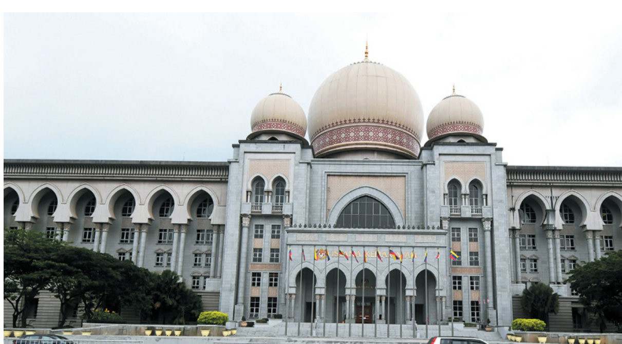
Palace of Justice: Located in Precinct 3, The Palace of Justice or Istana Kehakiman is home to two Appeal Courts and six Federal Courts. Previously, these courts were located at the Sultan Abdul Samad Building in KL before they moved to Putrajaya in the early 2000s. One might immediately associate this beautiful structure with the Taj Mahal.

Aside from offices, there are also places of worship such as the Putra Mosque and Tuanku Mizan Zainal Abidin Mosque. Beautiful bridges are also one of the prominent features in Putrajaya including the Putra Bridge, Seri Gemilang Bridge, Seri Saujana Bridge, Seri Setia Bridge and Seri Wawasan Bridge. Other buildings in the area include the Malaysian Islamic Development Department Complex, Malaysia Energy Commission Headquarters and Election Commission of Malaysia. Most of the buildings here are often noticeable from their unique architecture — for example, the Malaysia Energy Commission Headquarters is shaped like a diamond and the Palace of Justice resembles the Taj Mahal.