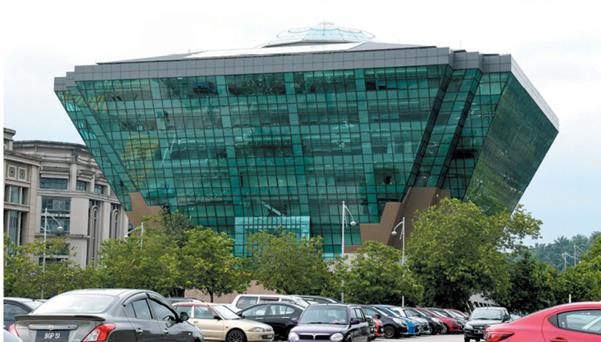
Malaysia Energy Commission Headquarters: This building is also known as the Diamond Building because the shape of the building resembles a diamond. First designed in 2005 and completed in 2010, it is built to showcase the use of sustainable materials and green technologies to cut down energy and water wastage. The building has been given multiple accolades including being recognised as a Green Building Index (GBI) Platinum- and Green Mark Platinum (Singapore)-certified building.

There are three Federal Territories in Malaysia — KL, Putrajaya and Labuan. Putrajaya was originally part of Selangor until 2001. The name Putrajaya was given in honour of Malaysia's first Prime Minister, Tunku Abdul Rahman Putra Al-Haj. In the Malay language, the word "putra" means prince while "jaya" means success. Some of the government offices located here include the Prime Minister's Department offices, the Ministry of Finance, the Ministry of Foreign Affairs and the Palace of Justice.