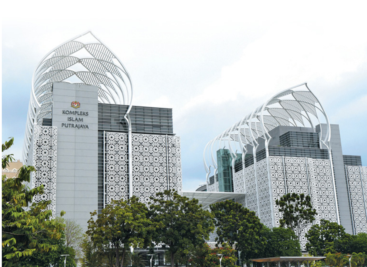
Malaysian Islamic Development Department Complex: Located in Precinct 3 of Putrajaya, this complex on 2.28ha of land was completed in March last year but was only open earlier this year. There are a total of four buildings sitting on three plots of land. It houses 11 agency offices. The owner of the building is Lembaga Tabung Haji.