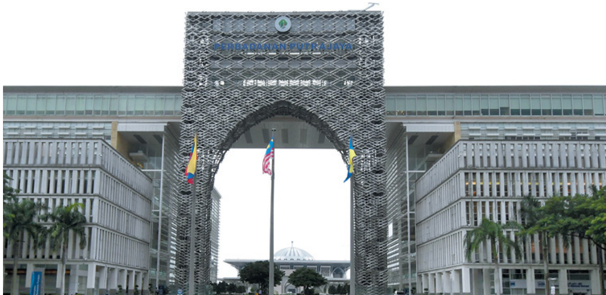
Putrajaya Corp: Putrajaya Corp or Perbadanan Putrajaya is the local authority for the Federal Territory of Putrajaya. It also promotes, stimulates, facilitates and undertakes commercial, infrastructure and residential developments in the area as well as the economic and social growth of Putrajaya.

One can also visit the Botanical Gardens, Putrajaya Equestrian Park and Alamanda Shopping Centre — the first shopping centre in Putrajaya — in Precinct 1. Another shopping mall in the vicinity is IOI City Mall, which opened end-2014.