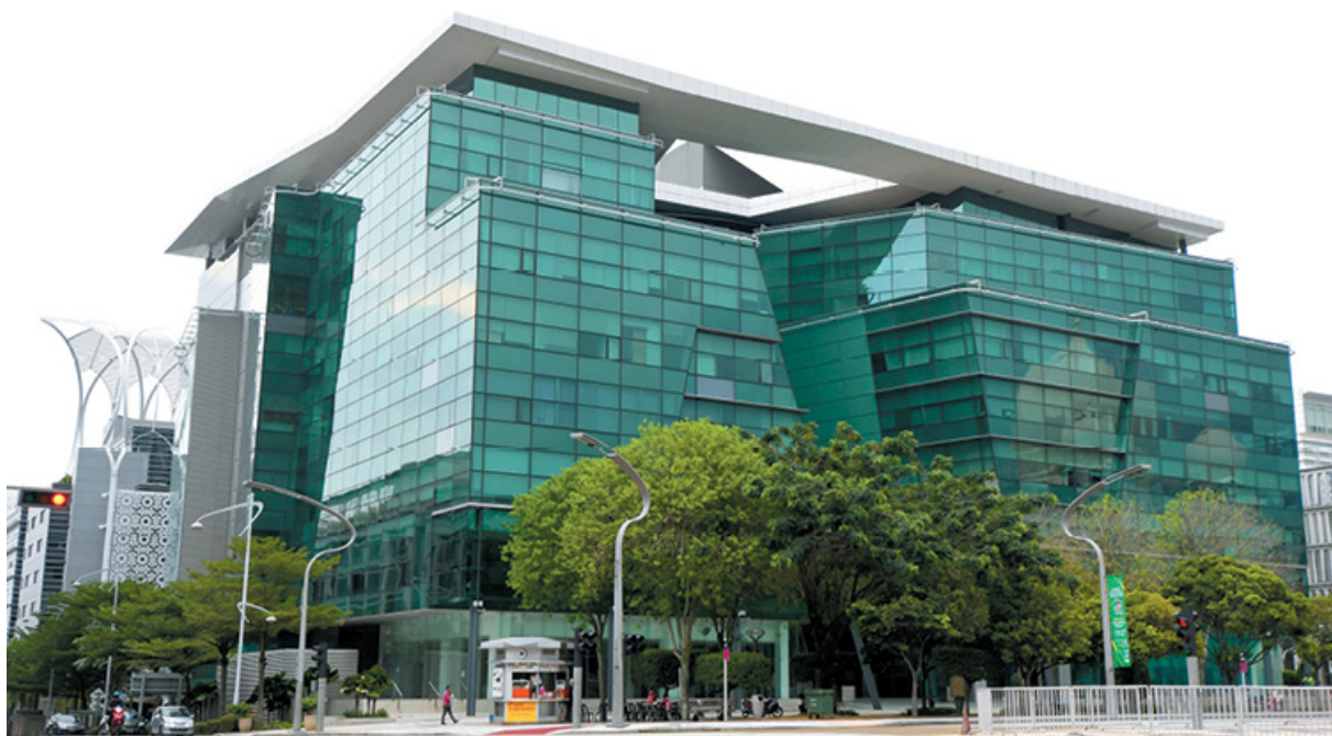
Menara Prisma: This 13-storey Grade A MSC-status office building is in Precinct 3 and is owned by Pelaburan Hartanah Bhd, a real estate investment holding company and a subsidiary of Yayasan Amanah Hartanah Bumiputera. It also comes with one level of retail space and two basement car parks. Among some of the tenants in the building are the Ministry of Health, the Razak School of Government and HSBC Amanah Putrajaya.