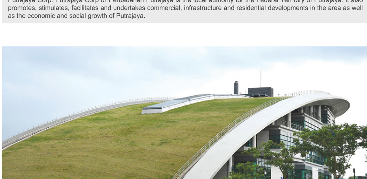
Heriot-Watt University Malaysia: Heriot-Watt University is a UK-based university that has set its first Malaysia campus in Putrajaya. The campus costs £35 million (RM193.85 million) to build and can accommodate up to 4,000 undergraduate and postgraduate students. Sitting on a 4.8-acre stunning lakeside, it also has the first living-grass roof which shades the naturally ventilated spaces below, reduces thermal transmittance and acts as an observation deck, accessible by glass lift. According to the university's official website, other environmentally friendly, passive design features include the campus' lighting which is "powered" by the maximum use of natural daylight, a rainwater harvesting system, and optimised air-conditioning and thermal control systems.