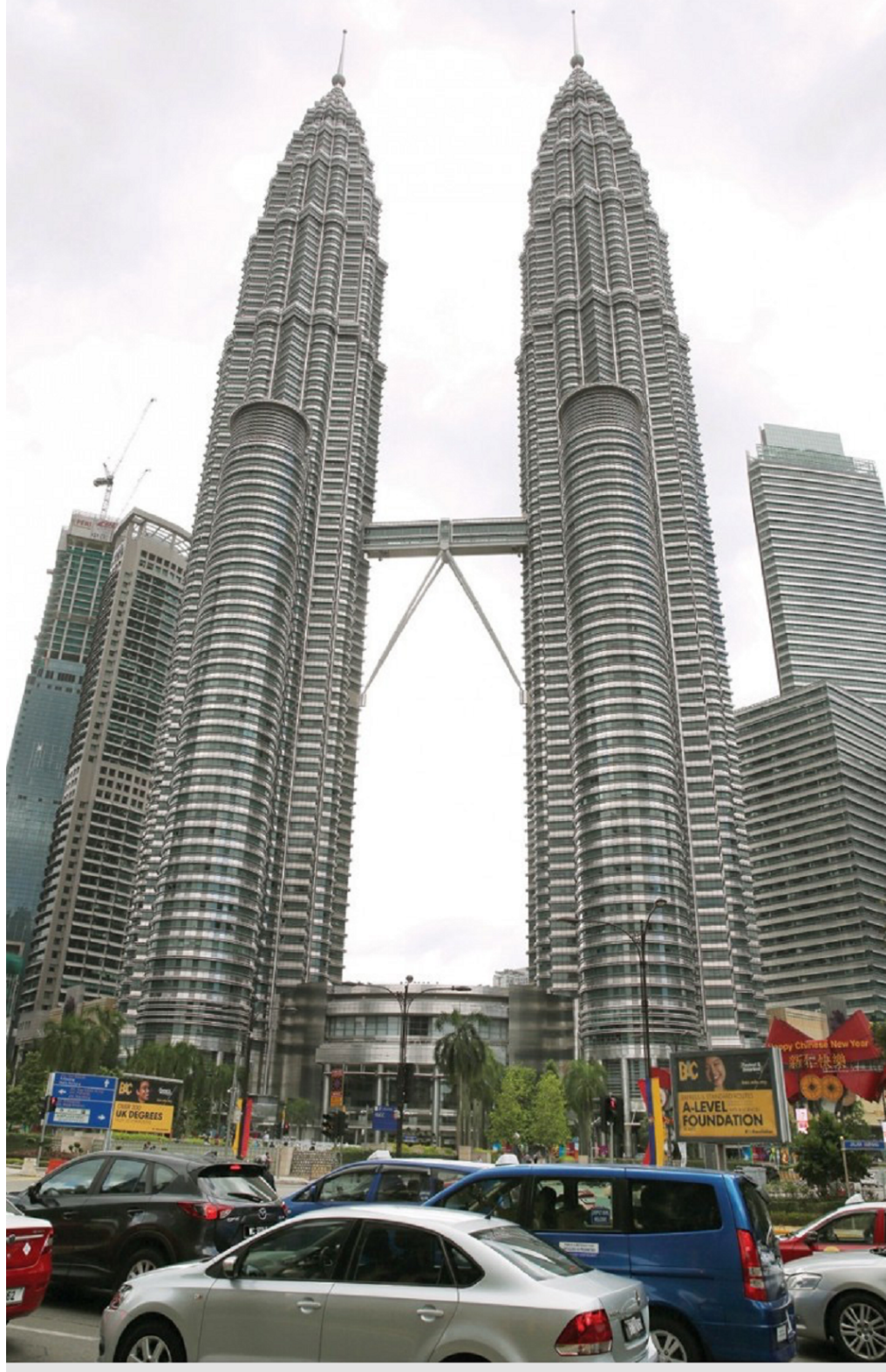
Despite being surrounded by new office buildings, Petronas Twin Towers is still the most wanted address for many MNCs.

The Petronas Twin Towers, more popularly known as KLCC, is the pride of our nation, but its symbolic status is not the winning factor. What is impressive is how the building has remained relevant and brand new even after 21 long years. Its high level of maintenance, tight security and forward thinking has successfully won the judges' approval to emerge the Gold winner in the non-strata commercial segment in the first TheEdgeProperty.com Malaysia's Best Managed Properties Awards 2017.