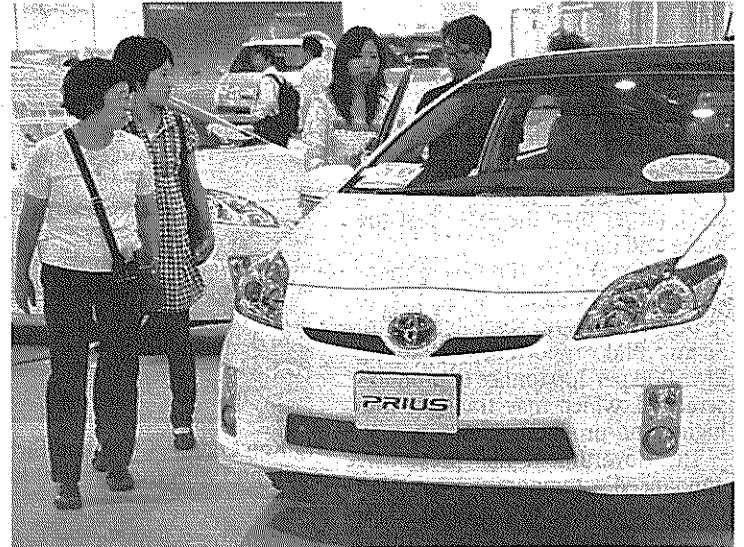
Customers check Toyota Motor's hybrid vehicle Prius at the company's showroom in Tokyo. Hopefully, more eco-friendly vehicles will be available in Malaysia at reasonably attractive prices.

Malaysia is its increasing heat levels. We can introduce tax credits or subsidies for energy-efficient walls, windows, roofs, air-conditioners and the use of waste gas to generate energy.